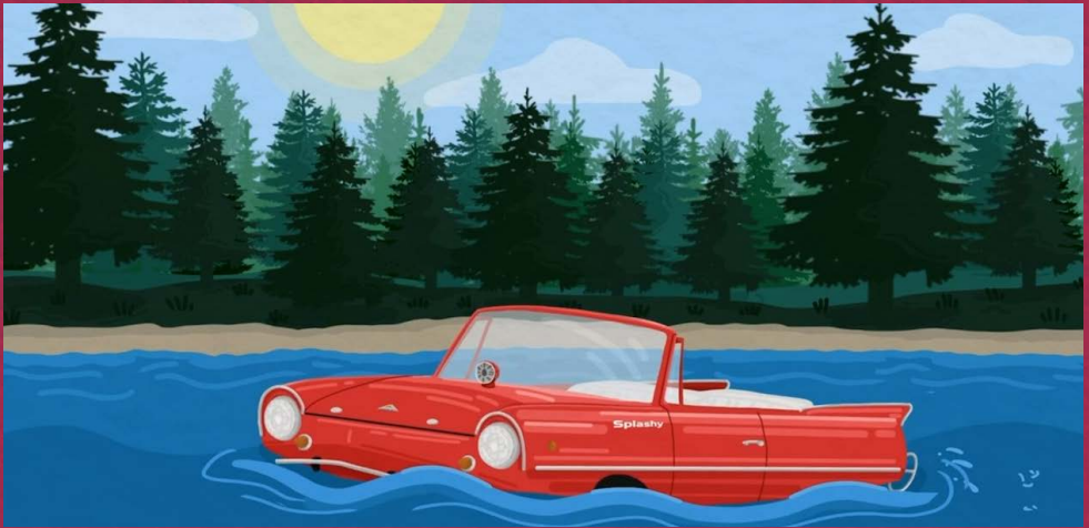
Faith - Amphicar770