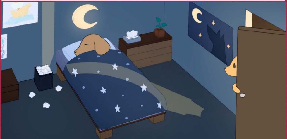
Kira - Noodog