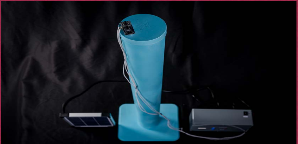
Alistair - Off-Grid Digital Water Tank Meter